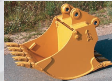
2-Way Bucket™ Patented