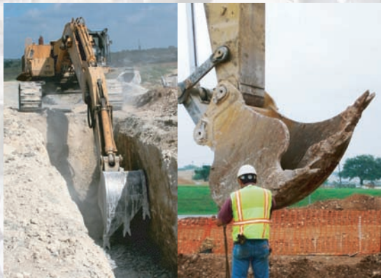
Hi-Cap Multi-Ripper Bucket Patented