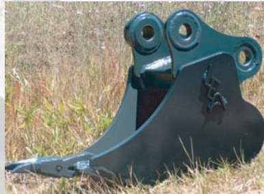
Single Pointed Ripper Bucket Patent Pending