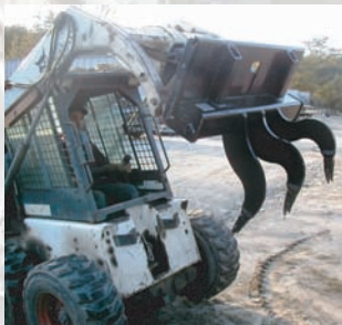
Skid Steer Multi-Ripper Patented